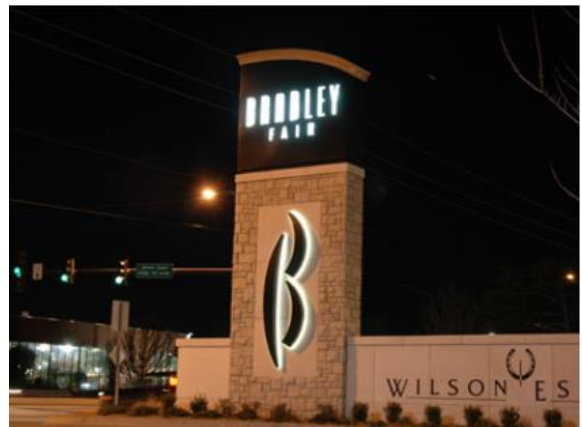
Pylon with creative elements