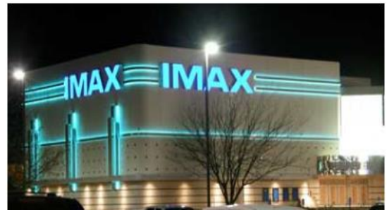
Wall sign with creative elements