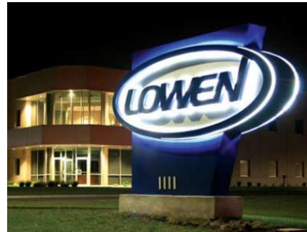
Monument with creative elements