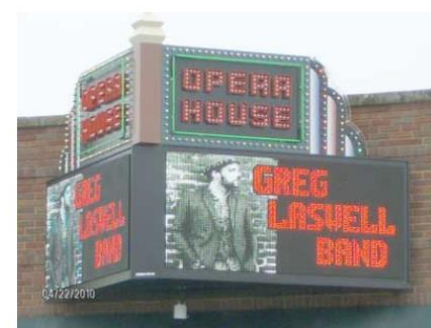
Marquee with creative elements