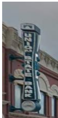
Projecting sign with creative elements