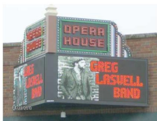
Marquee with creative elements