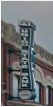
Projecting sign with creative elements