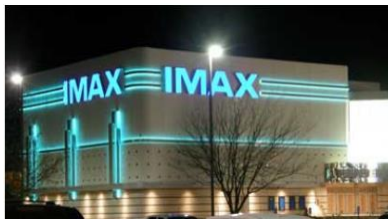
Wall sign with creative elements